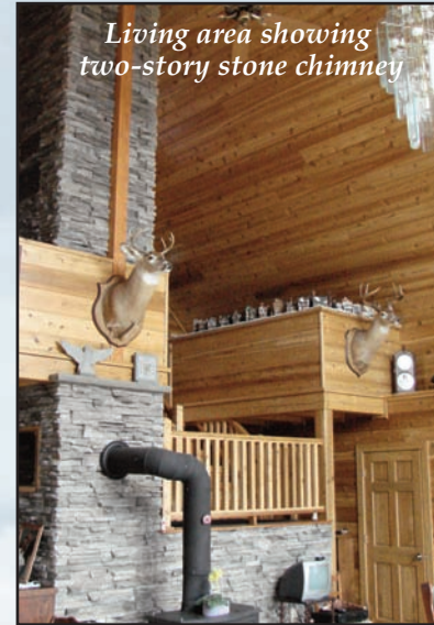
Living area showing two-story stone chimney

At Keepers of the Flag Bed and Breakfast, we truly believe that our home is your home. Our success is measured by return visitors. We are confident that one you have experienced our warm hospitality, you'll want to return again and again.