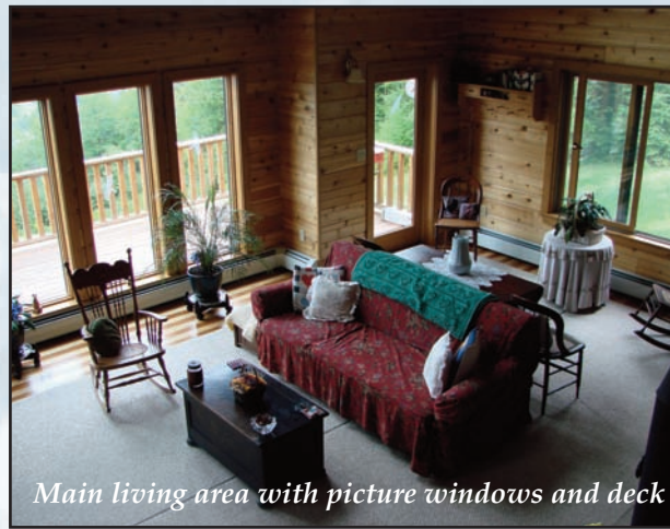
Main living area with picture windows and deck

Every measure has been taken to insure that your stay will be relaxing and convenient. When you're not enjoying our spectacular views, you'll find welcoming accommodations that are clean and quiet with modern amenities such as satellite TV and wireless internet access for the business traveler. Throughout, the atmosphere is rustic, yet light and airy with many windows and fresh, clean air.