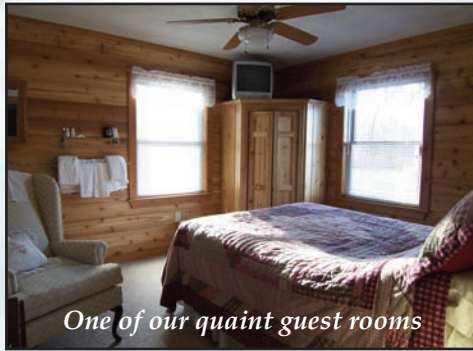
One of our quaint guest rooms

Inside, you'll find a brand new cedar log home filled with all the comforts of home and hosts who are always ready to please you. Our first priority is your comfort. Experience a tranquil night's rest in one of our quaint guest rooms and awaken to the delicious breakfast we will prepare for you.